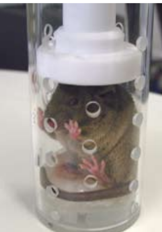
Animal Restrainer with animate Mouse