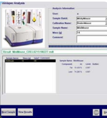
minispec Plus Software for Body Composition Analysis