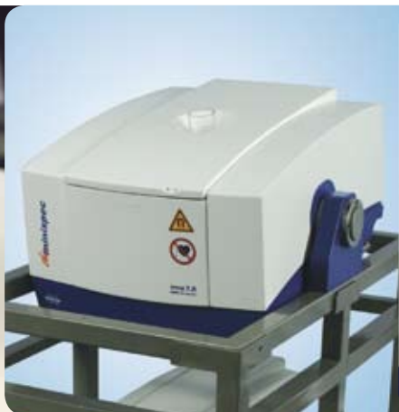
minispec Magnet on Cart for vertical and horizontal Access